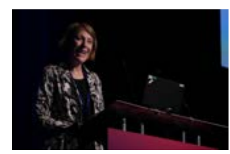
EABCT President Opening the Congress