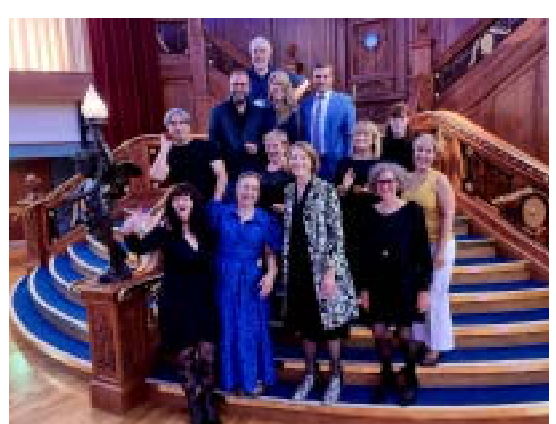
EABCT Reps at the Gala Dnner in the Titalnic

mixture of in-person, live remote and recorded presentation delivered to a mix of in-person and online delegates was a technical challenge but delegates were rewarded with the opportunity to watch over 120 hours of recordings of 95% of the programme for nearly 2 month after the congress.