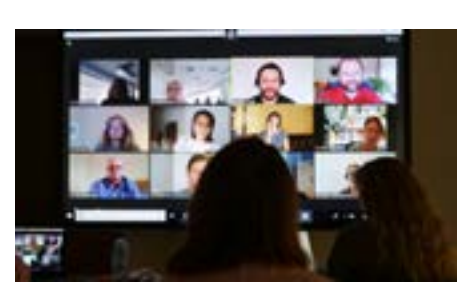
A Hybrd InCongress Workshop