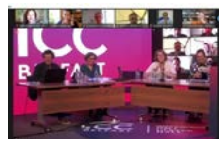
A Hybrd EABCT General Meeting