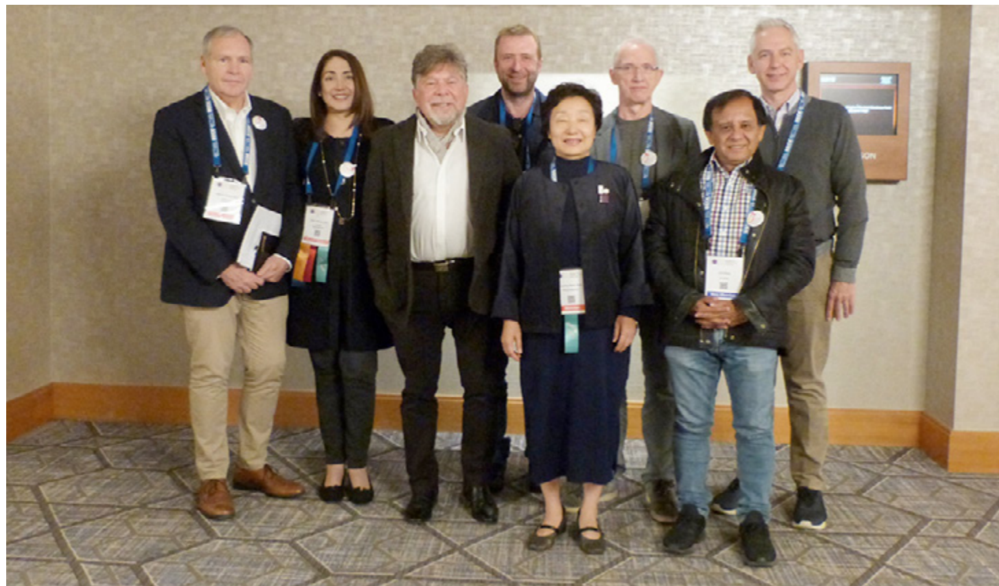
Last World Congress Committee in Washington, November 2018